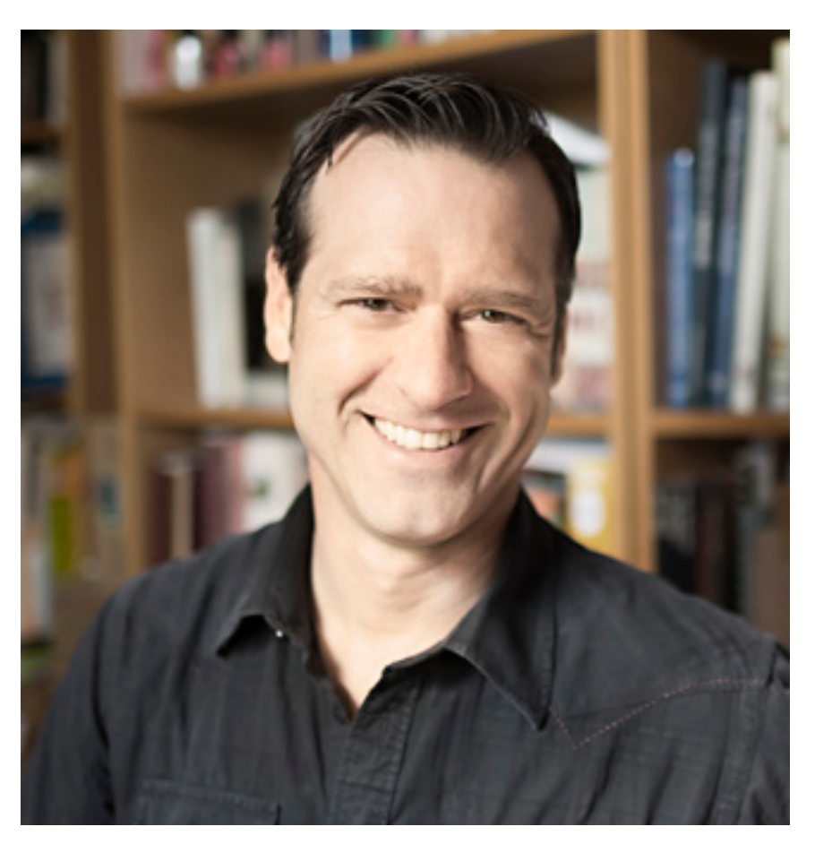
Co-author David Joachim has authored, edited or collaborated on more than 45 cookbooks.

For me, this is usually a difficult question. It really just depends on the day and what I'm craving. If it's a warm day and I'm in the mood to cook outdoors, then the Mushroom Brisket would be a go-to. If we're having a dinner party and I'm looking for a sexy starter, then the corn dumplings are definitely a winner; or if it's just a week night with the family, then the simple Nana's Red Sauce and fresh pasta would bring a smile to anyone around the table.